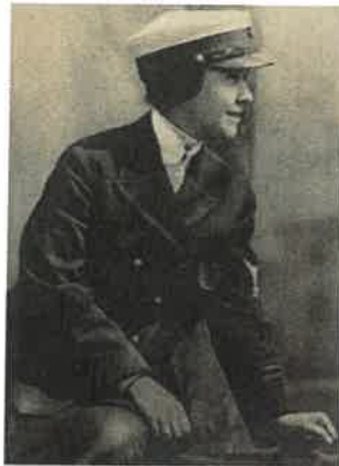
FIRST WOMAN RECRUIT IN U. S. NAVY